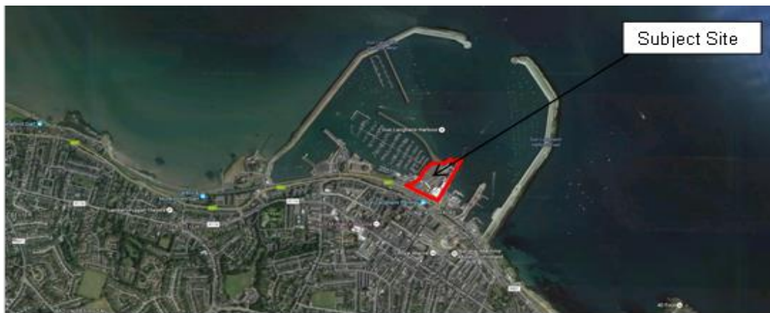
Figure 1: Aerial photo showing the subject site in context with the surrounding area

The opportunity to build on this reputation and to develop a National Watersports Centre to provide a state of the art training centre for watersports broadening participation in watersports and developing expertise. It will provide a very valuable facility for hosting national and international sailing and other watersport events. It can be delivered quickly and at a relatively low cost as a highly suitable site already exists within the harbour, the former HSS terminal and marshalling area.