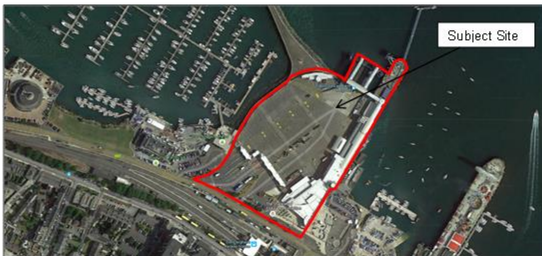
Figure 2: Aerial photo depicting the subject site